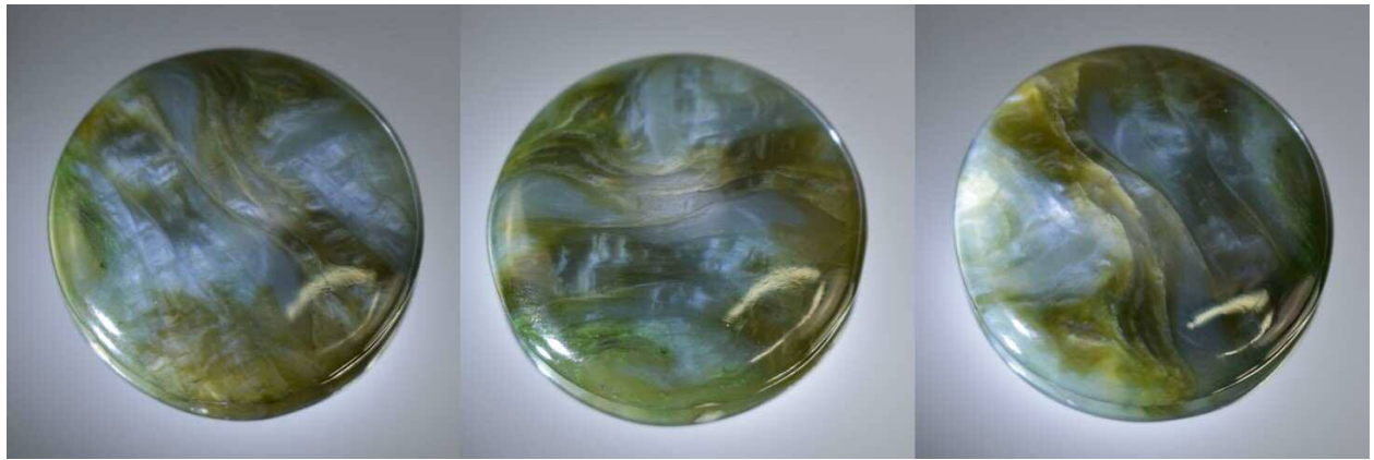
Figure 1: Composite picture of cabochon cut stone (JLCC5), showing the color change as the stone is rotated relative to a fixed light source. Stone is 36.5 mm by 35 mm in diameter and weighs 17.6 grams/87.9 carats.

Figures 1 to 7 below show a series of cut stones from Jade Leader's 100% owned DJ project which display color and texture variations on this color change phenomenon. While still photographs can illustrate how colors are seen from static viewing angles under daylight LED studio conditions, movement is needed to reveal the dramatic shimmering dramatic color transitions. Readers are invited to watch a special video of the stone's full visual effects presented in our latest Youtube Channel video "Change in the Jade World" here.