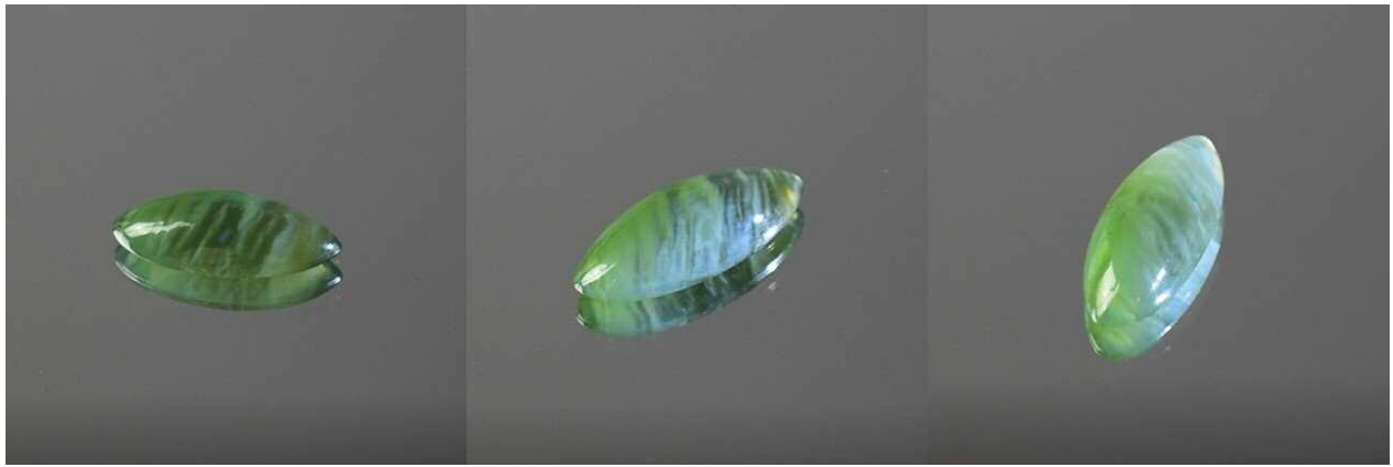
Figure 5: Composite picture of cut stone (JLCC10). Stone is a 17.1 mm by 7.4 mm marquise cut cabochon and weighs 0.7 grams/3.6 carats. High vitreous luster, high translucency in bands, and sharp color changes from dark to light greens and light blues.