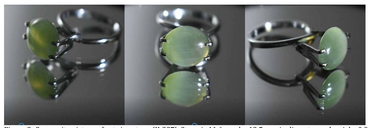
Figure 3: Composite picture of cut ring stone (JLCC7). Stone is 11.6 mm by 12.5 mm in diameter and weighs 0.94 grams/4.7 carats. While chatoyant or "cat's eye" Jades (both nephrite and jadeite) have been documented before from various locations, chatoyancy refers to a band of light caused by reflection along inclusions or parallel underlying fibers within the stone. It is not associated with an actual change of perceived color for the body of the stone itself.