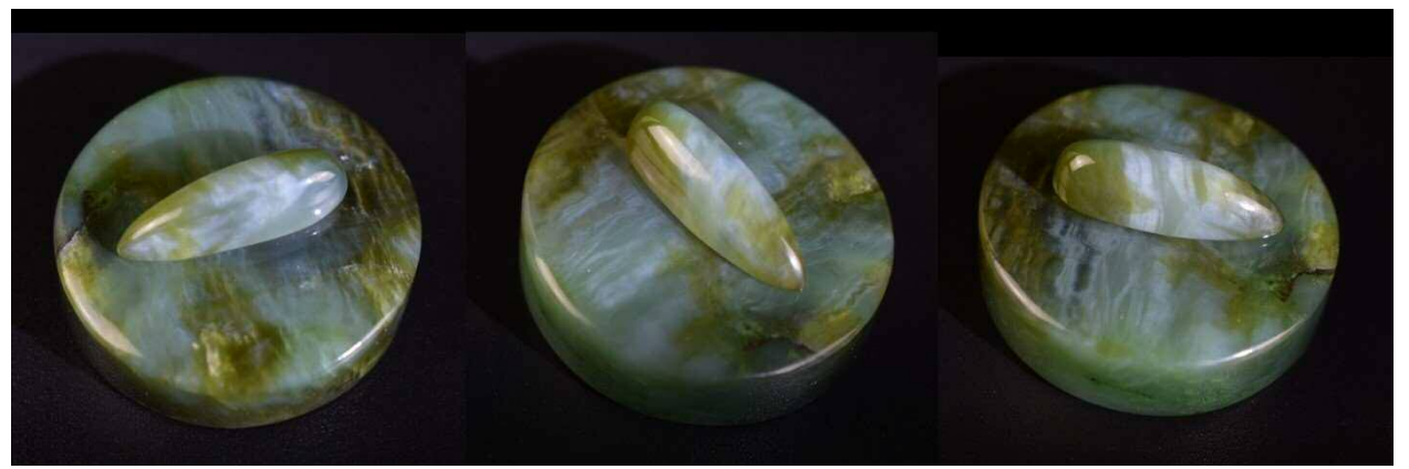
Figure 7: Composite picture of cut stones JLCC4 and 9 as also seen in motion exhibiting the change in color in our video "Change in the Jade World".

Identification work conducted to date on this material from surface samples relied heavily on SEM/EDS (Scanning Electron Microscope/Energy Dispersive X-Ray Spectroscopy) as well as thin section and hand sample microscope work to understand the relationship to perceived color to the main mineralogical characteristics of the nephrite Jade itself.