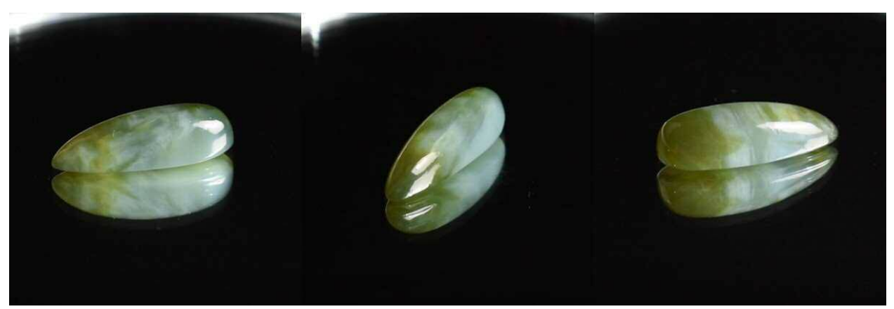
Figure 6: Composite picture of cut stone (JLCC9). Stone is a 23.5 mm by 7.8 mm drop cut cabochon and weighs 2.13 grams/10.6 carats.