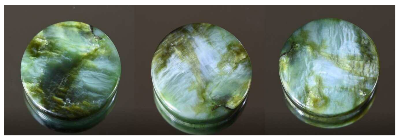
Figure 2: Composite picture of cut stone(JLCC4). Stone is 36.6 mm by 36.1 mm in diameter and weighs 33 grams/165 carats.